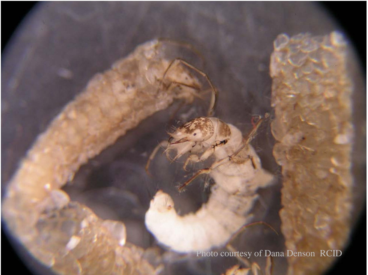
caddisfly Trichoptera Oecetis sp. C with case.