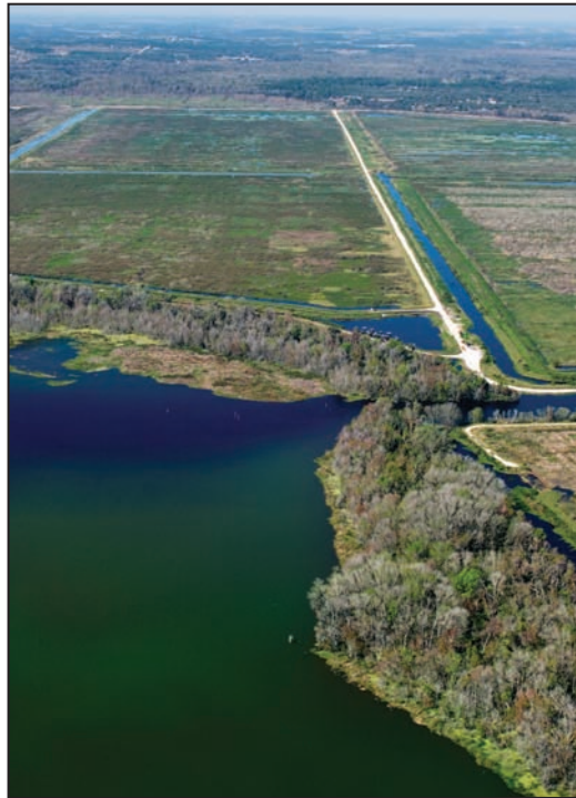
An aerial view shows phase 1 of the Lake Apopka Marsh Flow-Way.

This central Florida lake degraded during a period of more than 50 years (beginning in the 1940s), as farms located in the lake's historic marshes pumped millions of gallons of water, laden with fertilizers and other chemicals, off farm fields into the 31,000-acre lake.